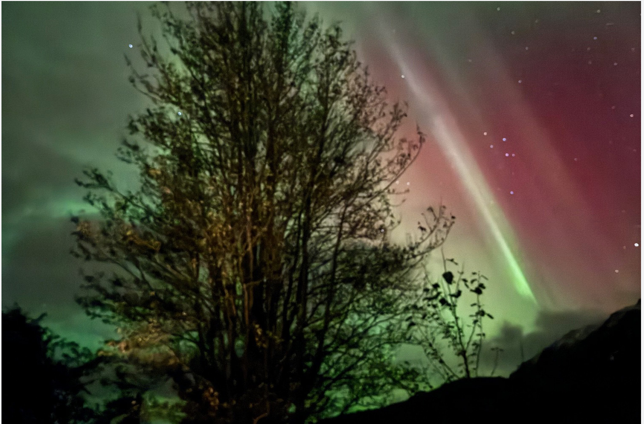
Northern Lights (Louisville CO on October 10, 2024)

FIRST CONGREGATIONAL UNITED CHURCH OF CHRIST · BOULDER