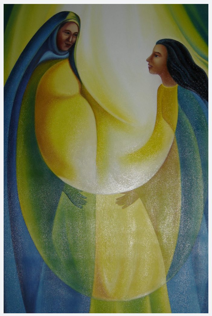
Mary and Elizabeth - Painting in the Church of El Sitio, Suchitoto, El Salvador