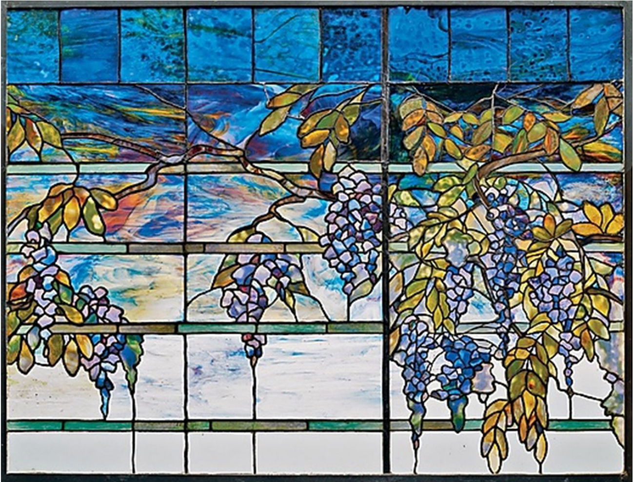
View of Oyster Bay - Louis Comfort Tiffany

FIRST CONGREGATIONAL UNITED CHURCH OF CHRIST · BOULDER