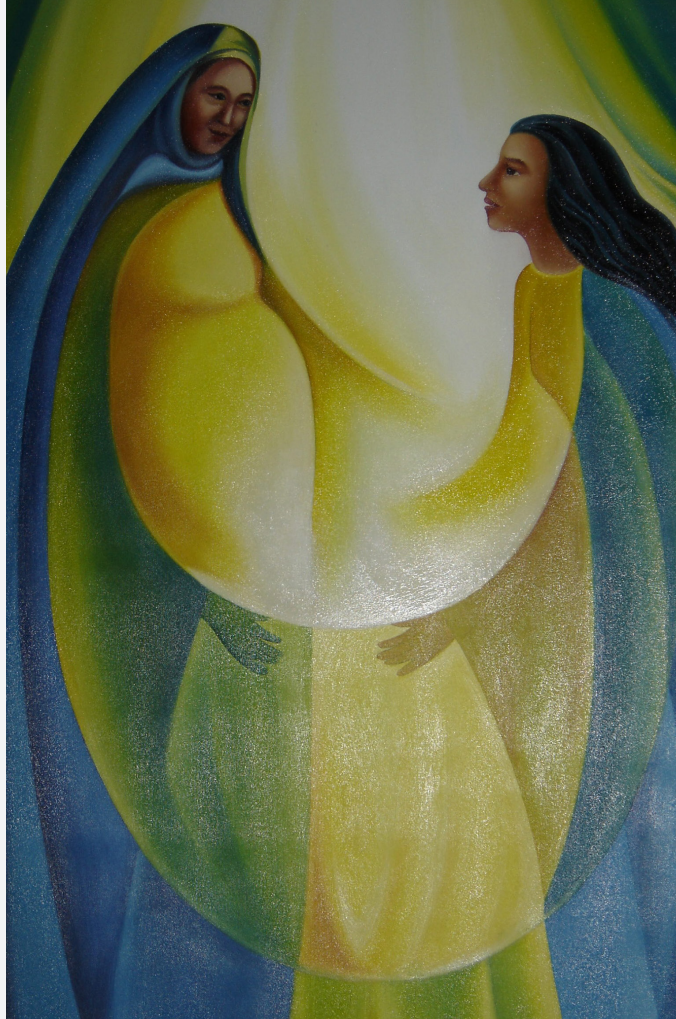
Mary and Elizabeth - Painting in the Church of El Sitio, Suchitoto, El Salvador

FIRST CONGREGATIONAL UNITED CHURCH OF CHRIST · BOULDER