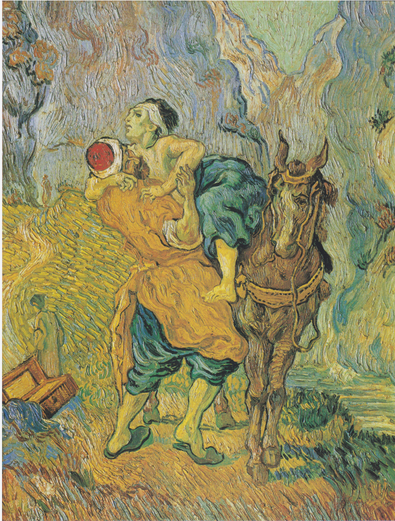
The Good Samaritan, Vincent van Gogh

FIRST CONGREGATIONAL UNITED CHURCH OF CHRIST · BOULDER